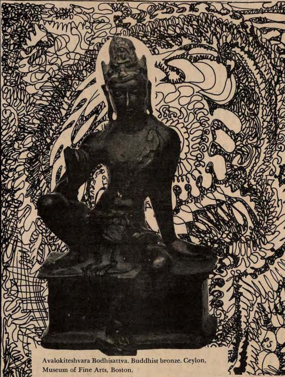
Avalokitesvara Bodhisattva. Buddhist bronze, Ceylon, Museum of Fine Arts, Boston.

Koko An is the home of a small group of Zen Followers in Hawaii.